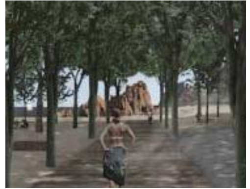
Penn State’s H. Campbell and Eleanor R. Stuckeman School of Architecture and Landscape Architecture is a leader in professional design education comprised of an interdisciplinary confederation of strong design disciplines: Architecture, Design, and Landscape Architecture.