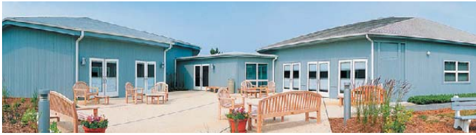
Virden Center University of Delaware Hugh R. Sharp Campus 700 Pilottown Road Lewes, DE 19958