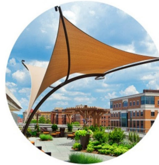
Tensile Shade Structure