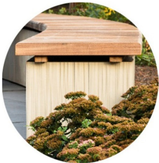
Textured Seat Wall