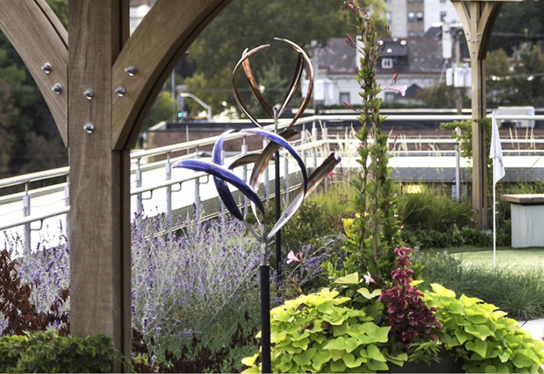
Colorful wind sculptures provide movement and focal points.