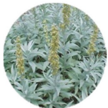
Valerie Finnis White Sage