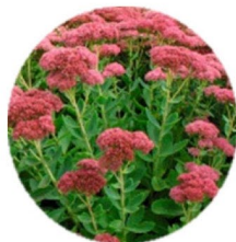
Autumn Joy Sedum