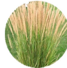
Karl Foerster Reed Grass