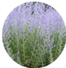
Blue Spire Russian Sage