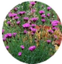
Clusterhead Pink Dianthus