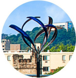
Kinetic Wind Sculpture