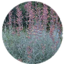
Rock Anise Hyssop