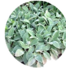
Silver Carpet Lamb's Ears