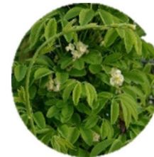
Five-leaf Akebia Vine