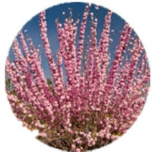
Pink Flowering Almond