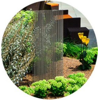
Interactive Sound Sculpture