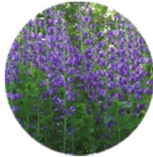
Midnight Blue Wild Indigo