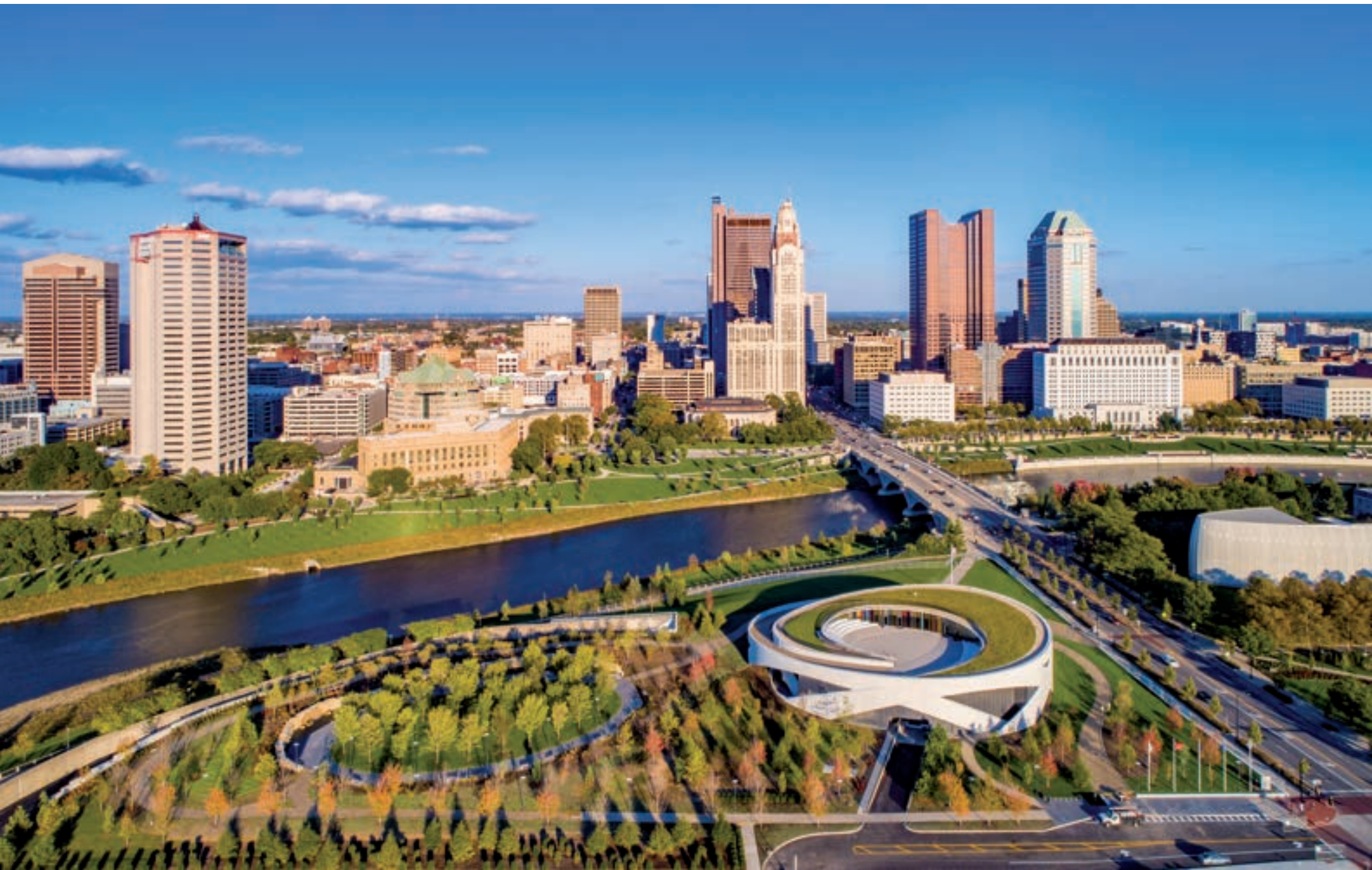
The National Veterans Memorial and Museum project weaves together building and landscape through a series of curvilinear paths that maximizes expansive views to the Scioto River and Downtown Columbus or the city beyond.