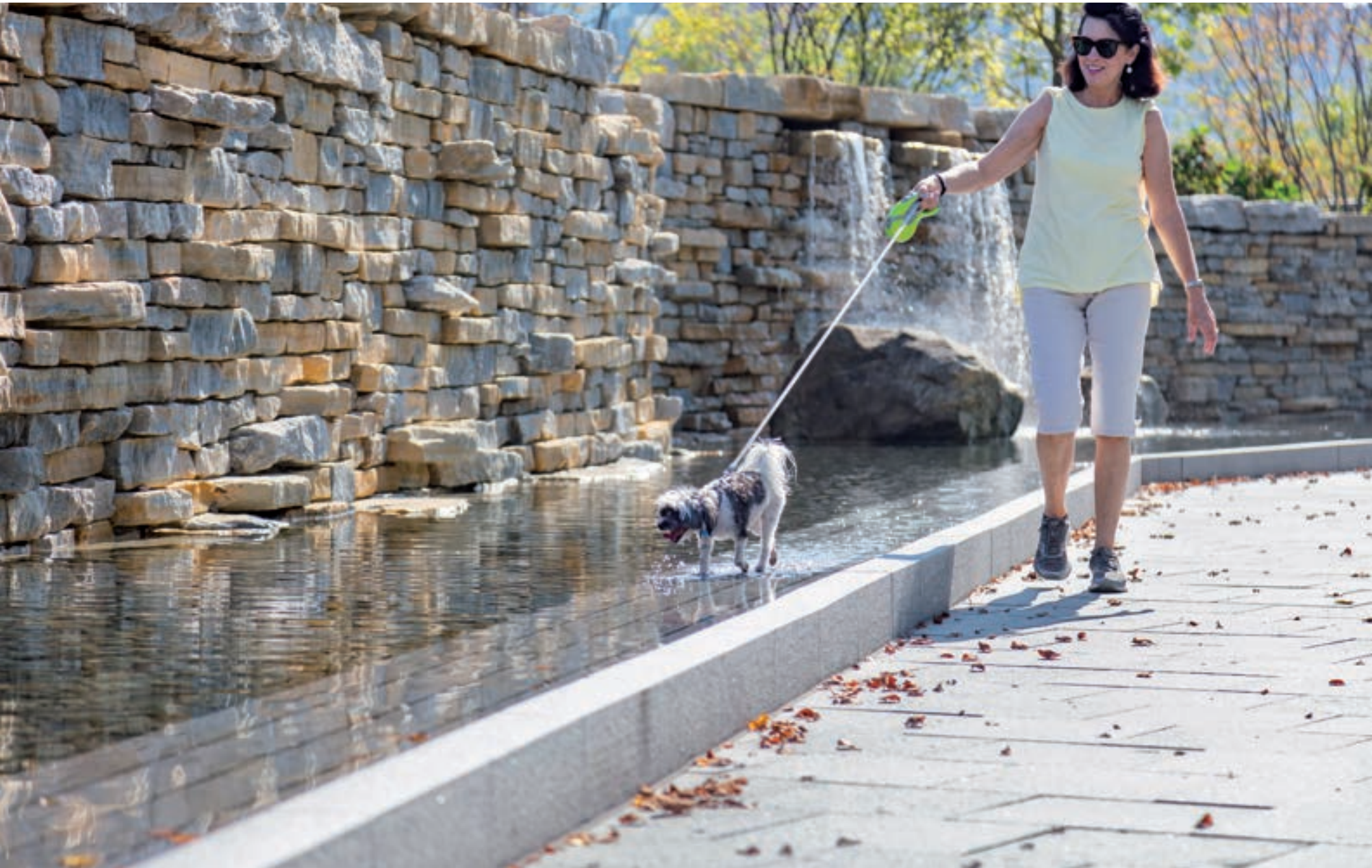
Nearby residents and visitors to the adjacent Science Center and riverfront use the garden as a place of refreshment as part of their daily rituals.