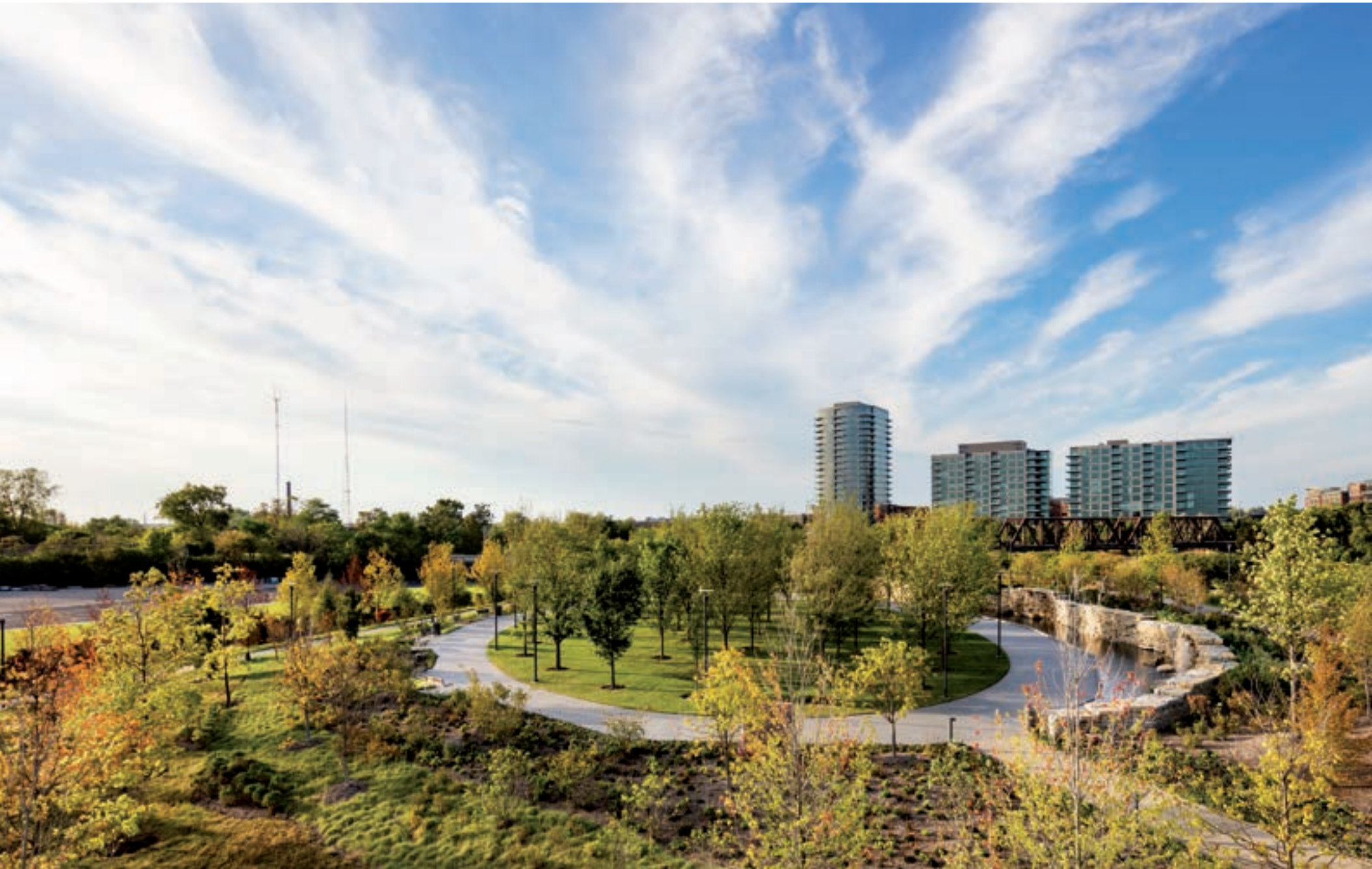
The Memorial Grove features four species of American Elms, a quintessential tree in the American landscape that has greeted thousands of veterans as they returned home from service and conflict throughout our nation's history.