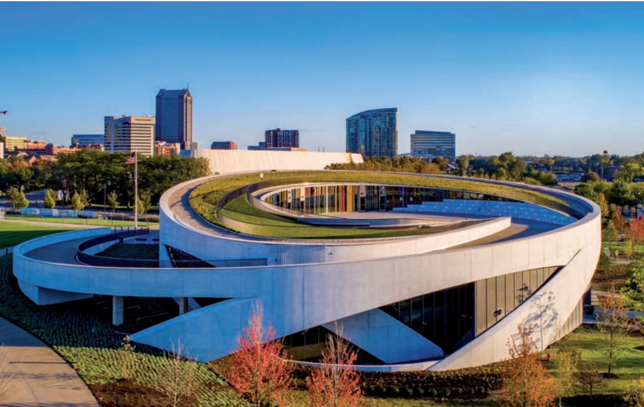
The sky ramp culminates in the green roof and amphitheater, allowing visitors to take in views of the city, the cultural district, and the Memorial Grove.