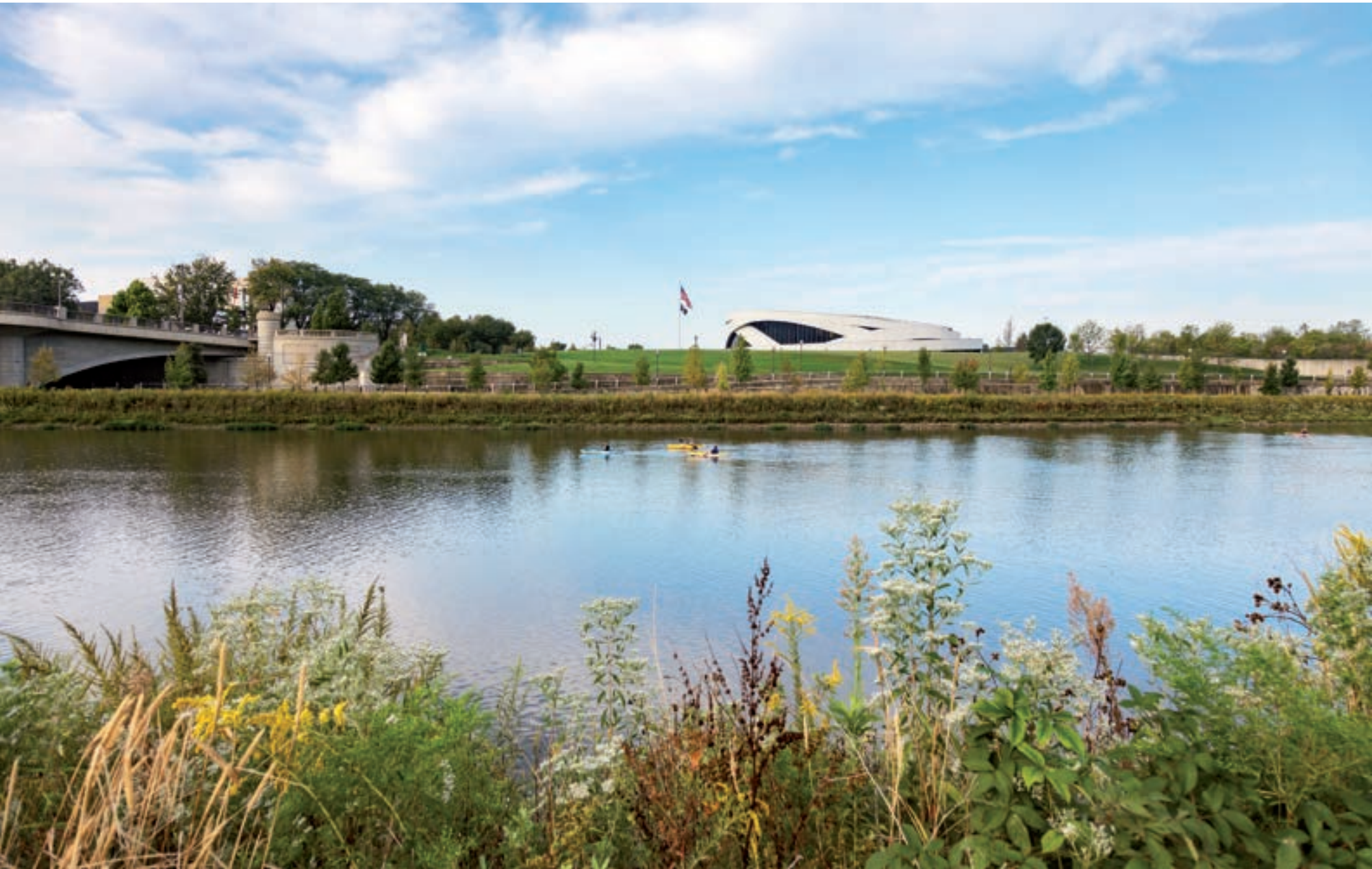
The National Veterans Memorial and Museum is a national destination situated on the Scioto River peninsula across from downtown Columbus. The Museum and Memorial Grove are visible from the water's edge, where recreation is enjoyed on a daily basis.