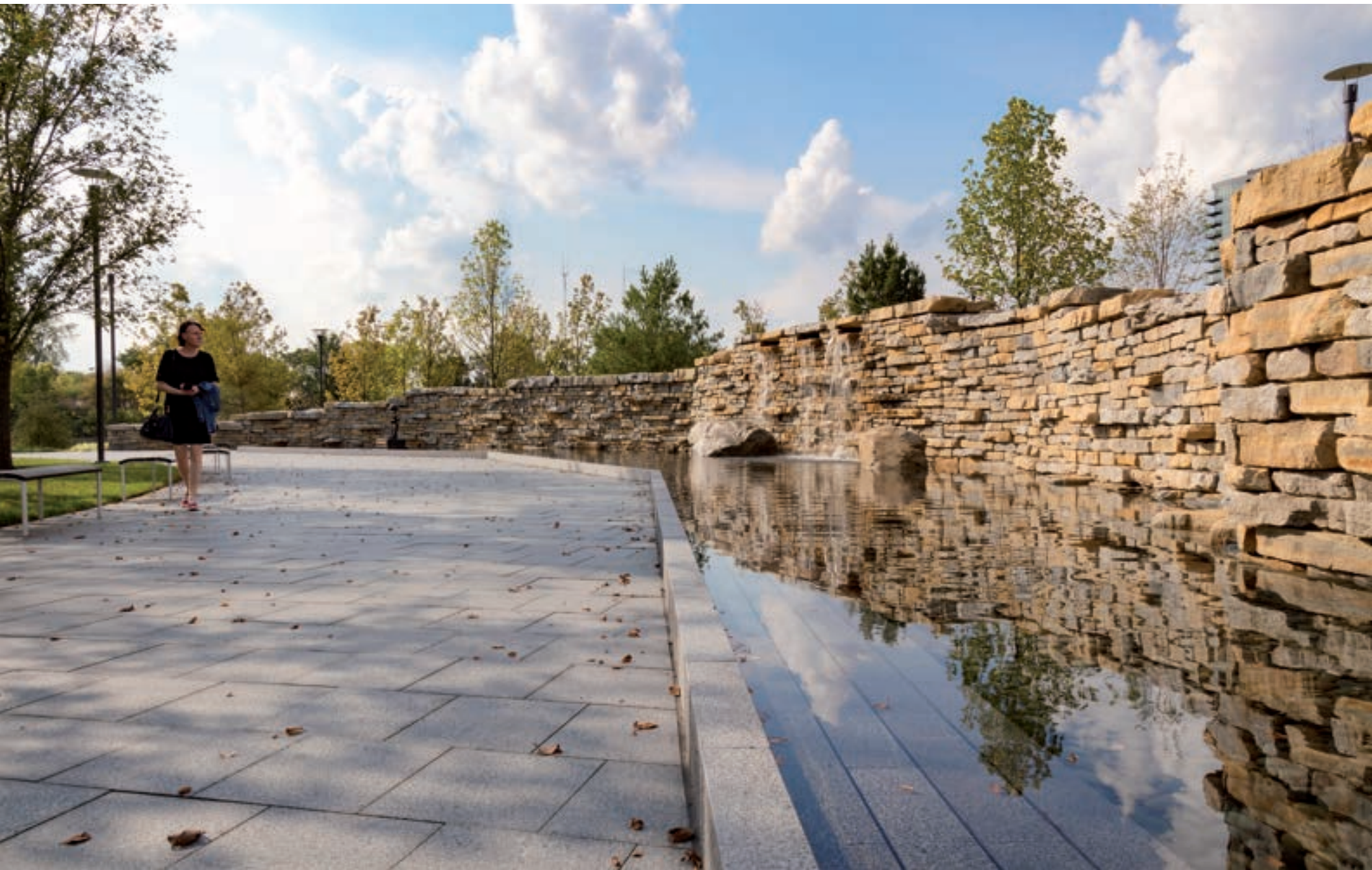
A Soldier's Cross monument was placed within the fountain at the far end of the Memorial Grove to allow visitors to honor those who have fallen as a result of their service; ceremonies for veterans and families are held regularly.