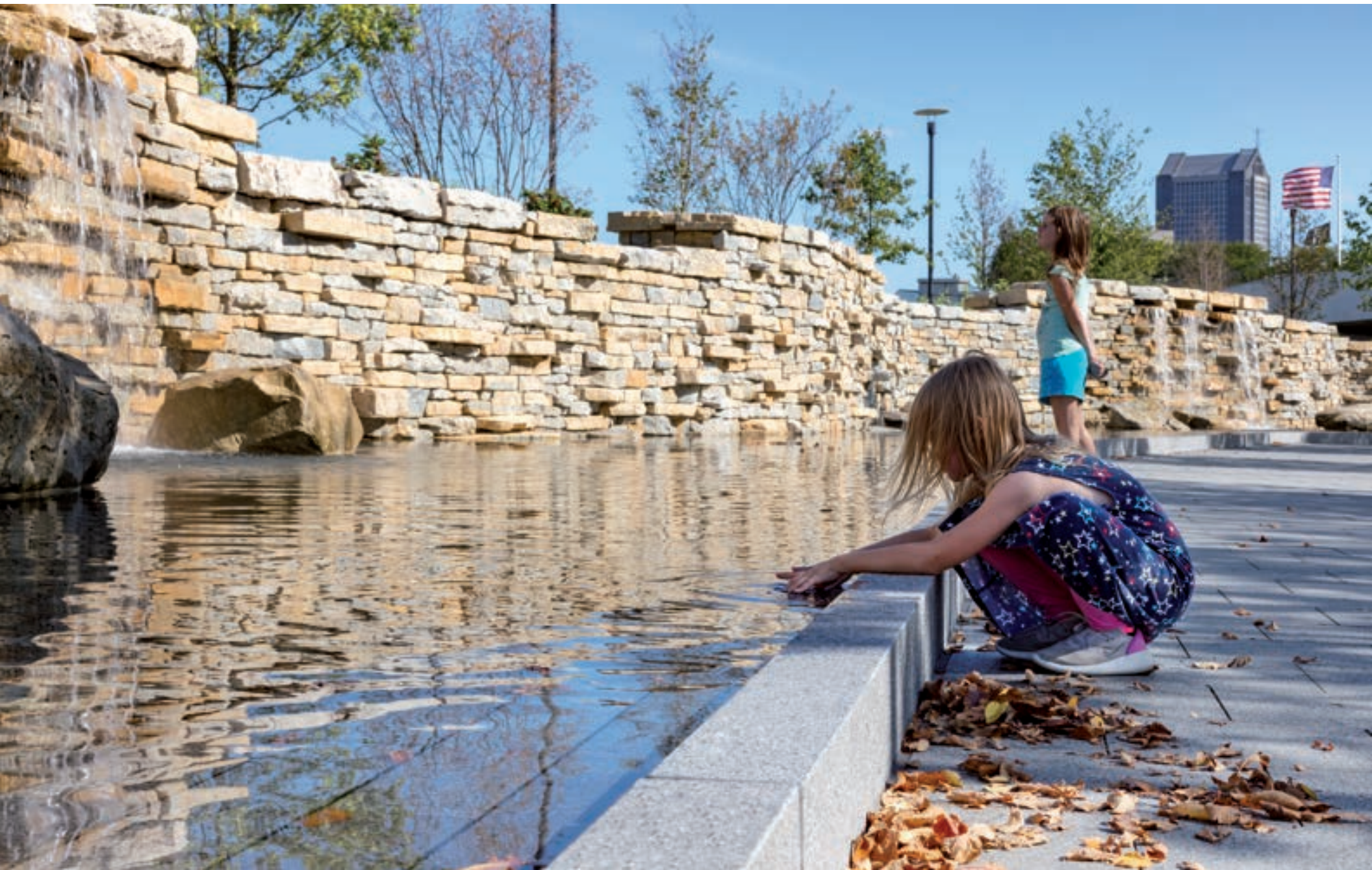
The fountain provides a calming sound, contributing to the contemplative atmosphere of the Memorial Grove. Over 350 feet in length, the fountain represents an abstraction of the native Ohio landscape of the Hocking Hills and its waterfalls.