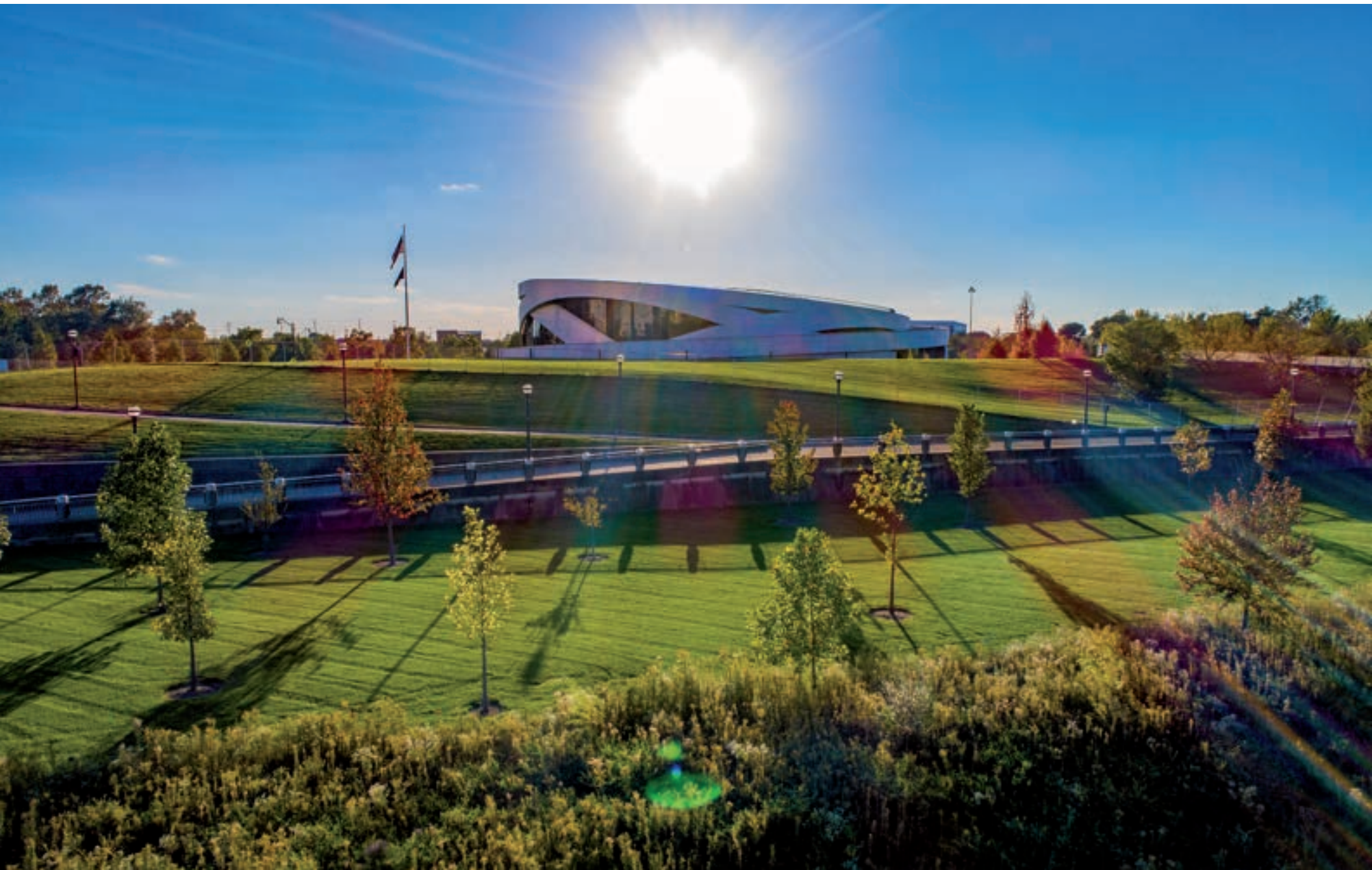
The walking trails along the river inspired the curvilinear forms that marry the building to its site, culminating in a sky ramp that grows out of the earth and a rooftop amphitheater that can be accessed daily for special events.