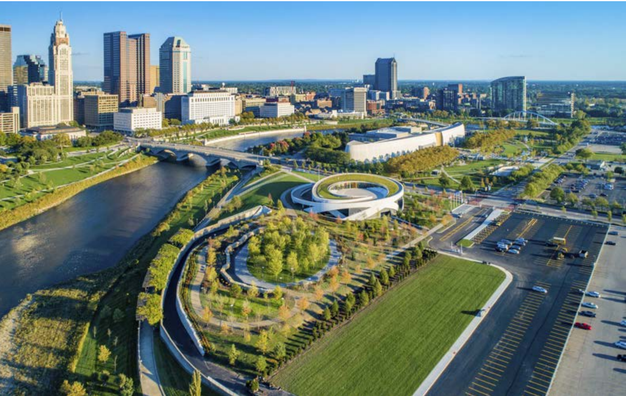
The National Veterans Memorial and Museum is the first in a series of projects planned to create a cultural district on the Scioto Peninsula, which will be surrounded by a future mix of uses: housing, office, and retail.