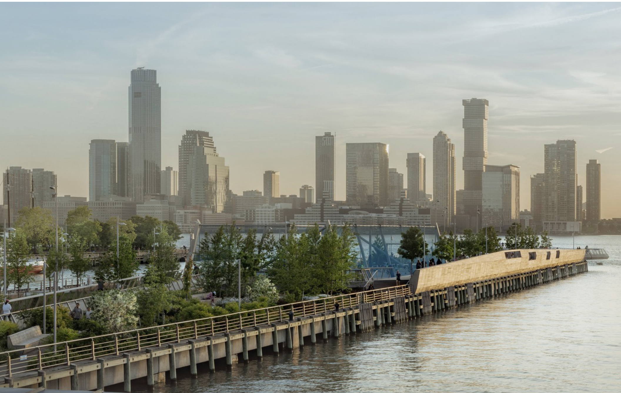
Pier 26 stretches 850 feet from shore. The ecologically programmed pier also has flexible recreation spaces with the 900-person capacity great lawn and a Sport Court providing a new recreation and leisure destination for Manhattan.