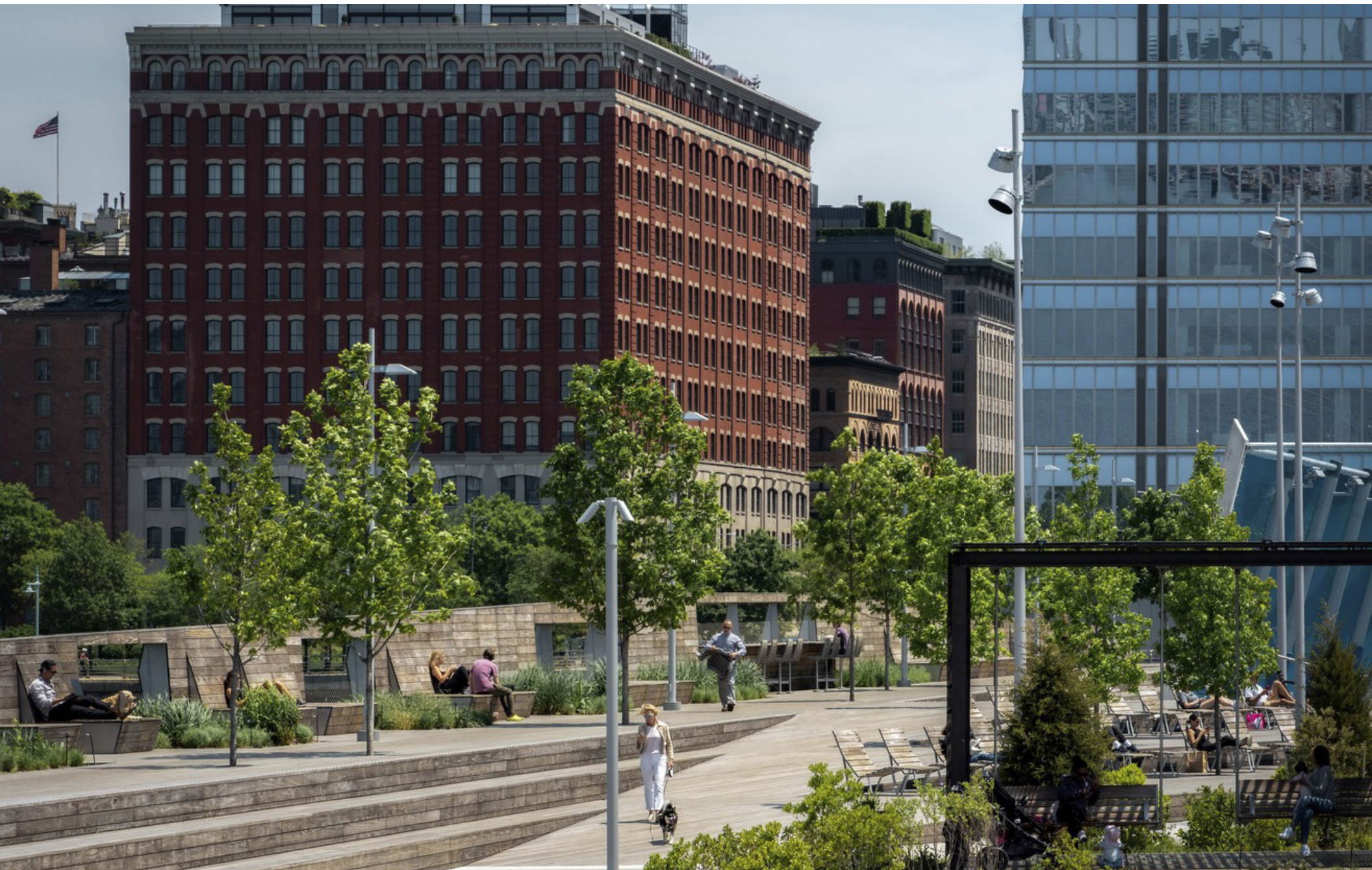
The design team created an immersive ecological experience at Pier 26 by embedding a multiplicity of activities and seating opportunities within the estuarine environment.