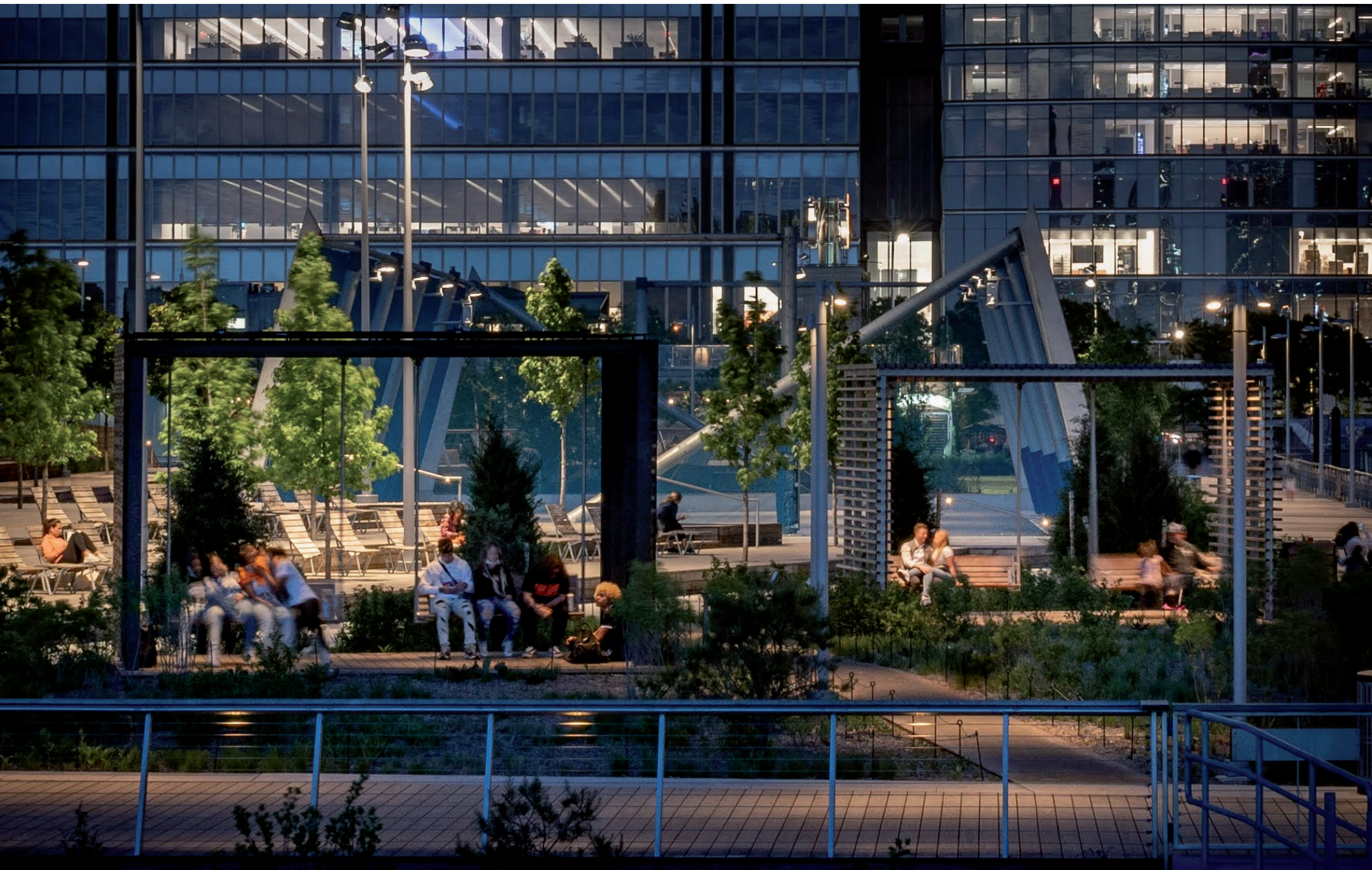
Pier 26 is a place of enjoyment and education for all ages, abilities, and backgrounds. The welcoming porch swings framed by the sheds in the heart of the maritime scrub ecozone are the perfect place for visitors to come together.