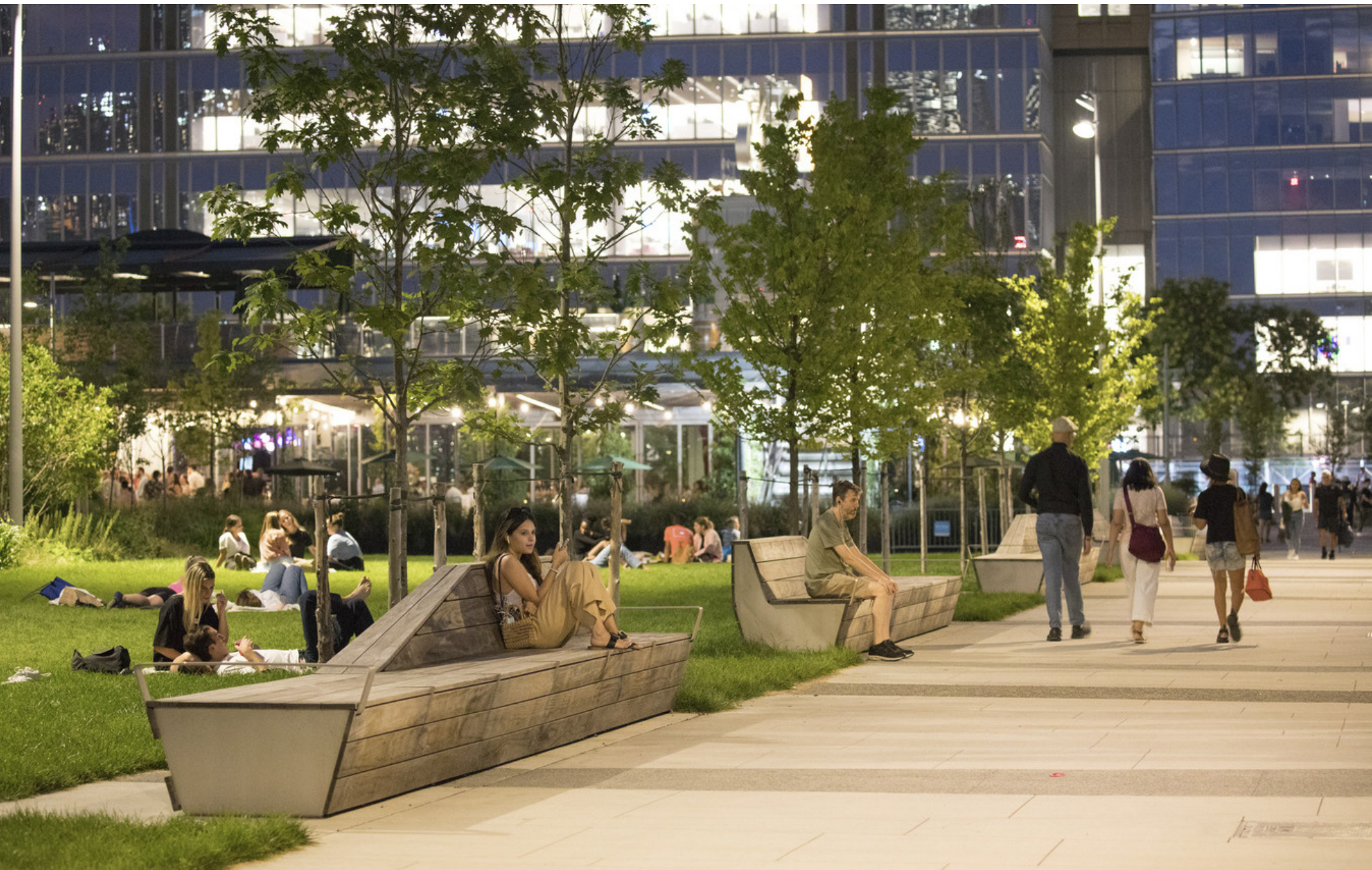
Pier 26 is a hotspot for socializing and people-watching throughout the day. Each section features custom furnishings, perfect for gatherings of all sizes.