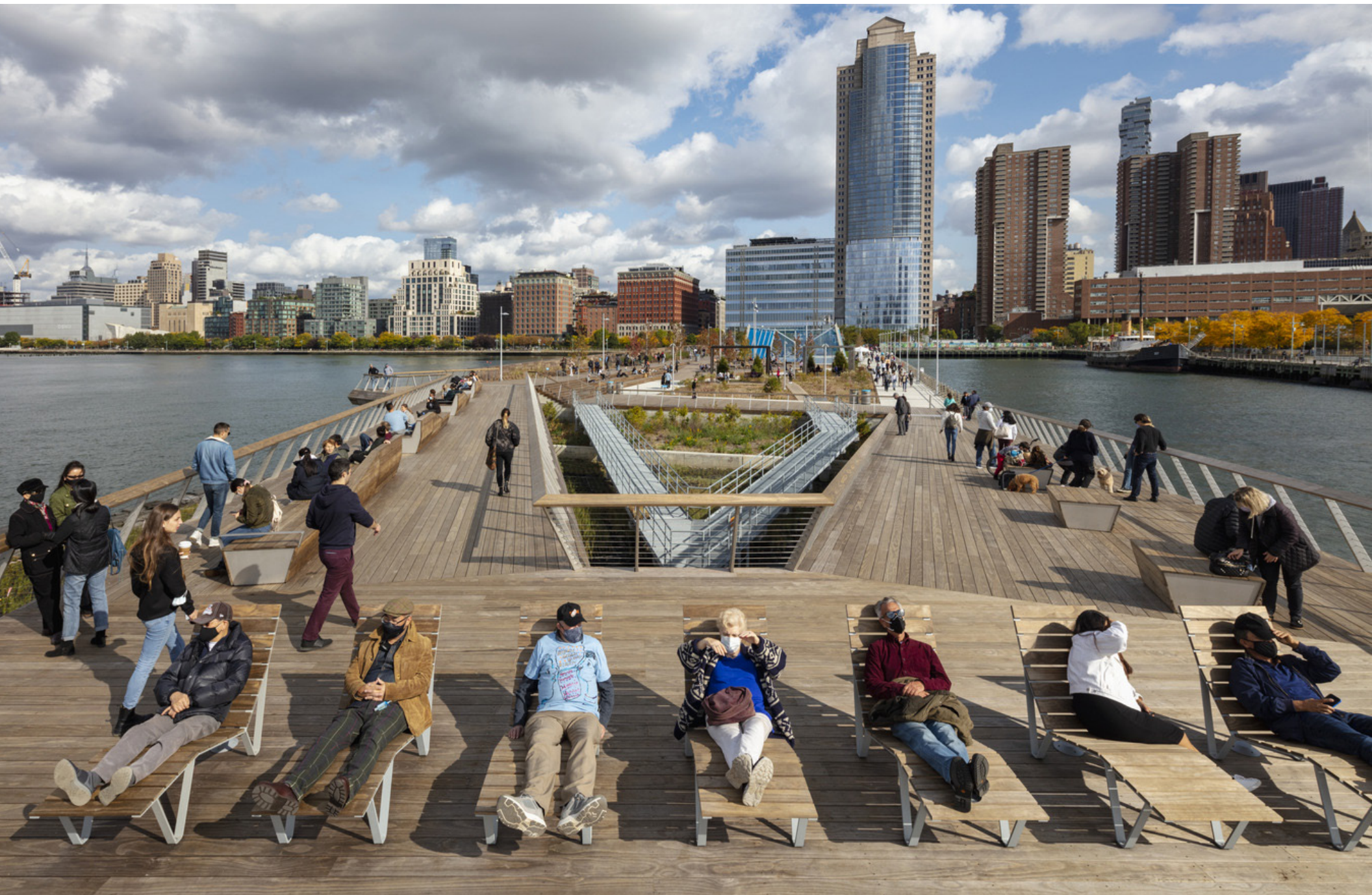
Pier 26 at Hudson River Park opened to the public in the fall of 2020, an immersive ecological and social experience on a disused maritime pier.