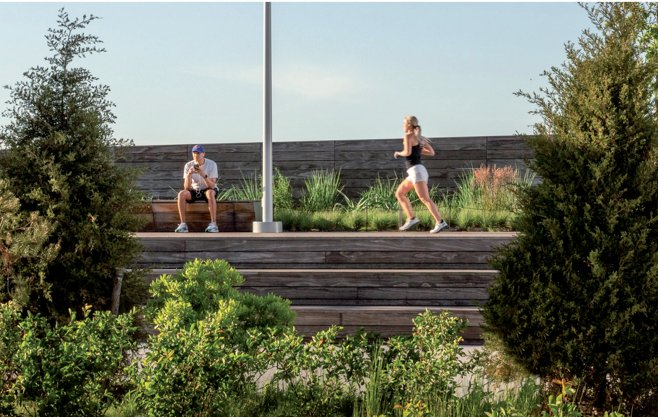
Joggers run along the Social Deck, a single massive sustainable Kebony wood structure traversing every ecozone in the park, from the start of the woodland forest to the rocky tidal zone and out over the Hudson River Estuary.