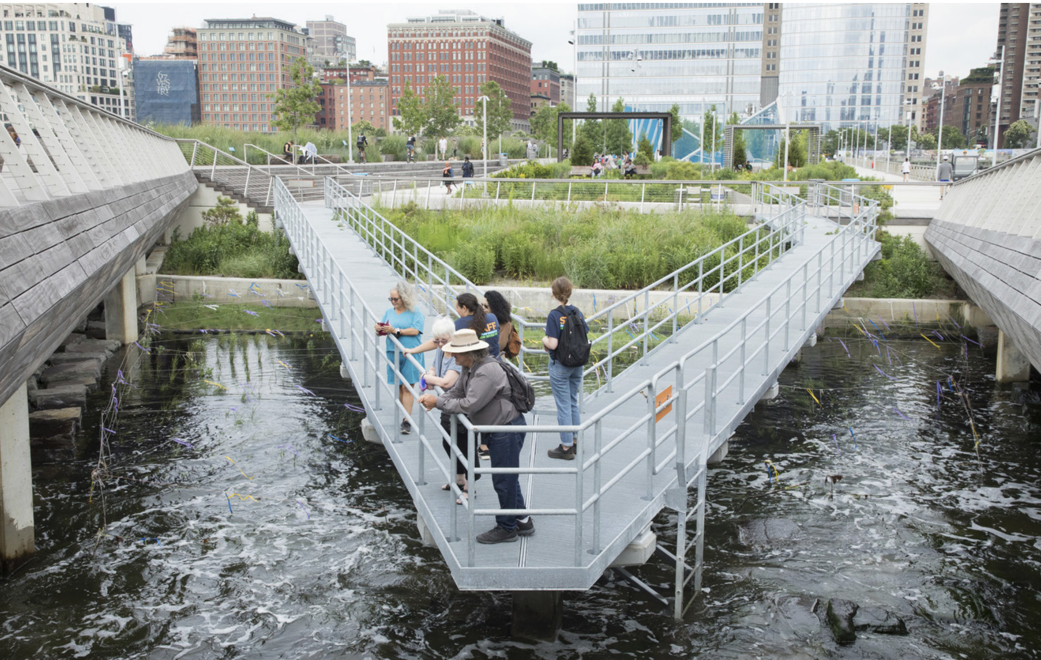
Stretching out from the maritime scrub ecozone, a steel walkway structure hovers just eight feet above the rocky tidal zone at low tide. During high tide, the lapping water splashes waves up and over its edges.