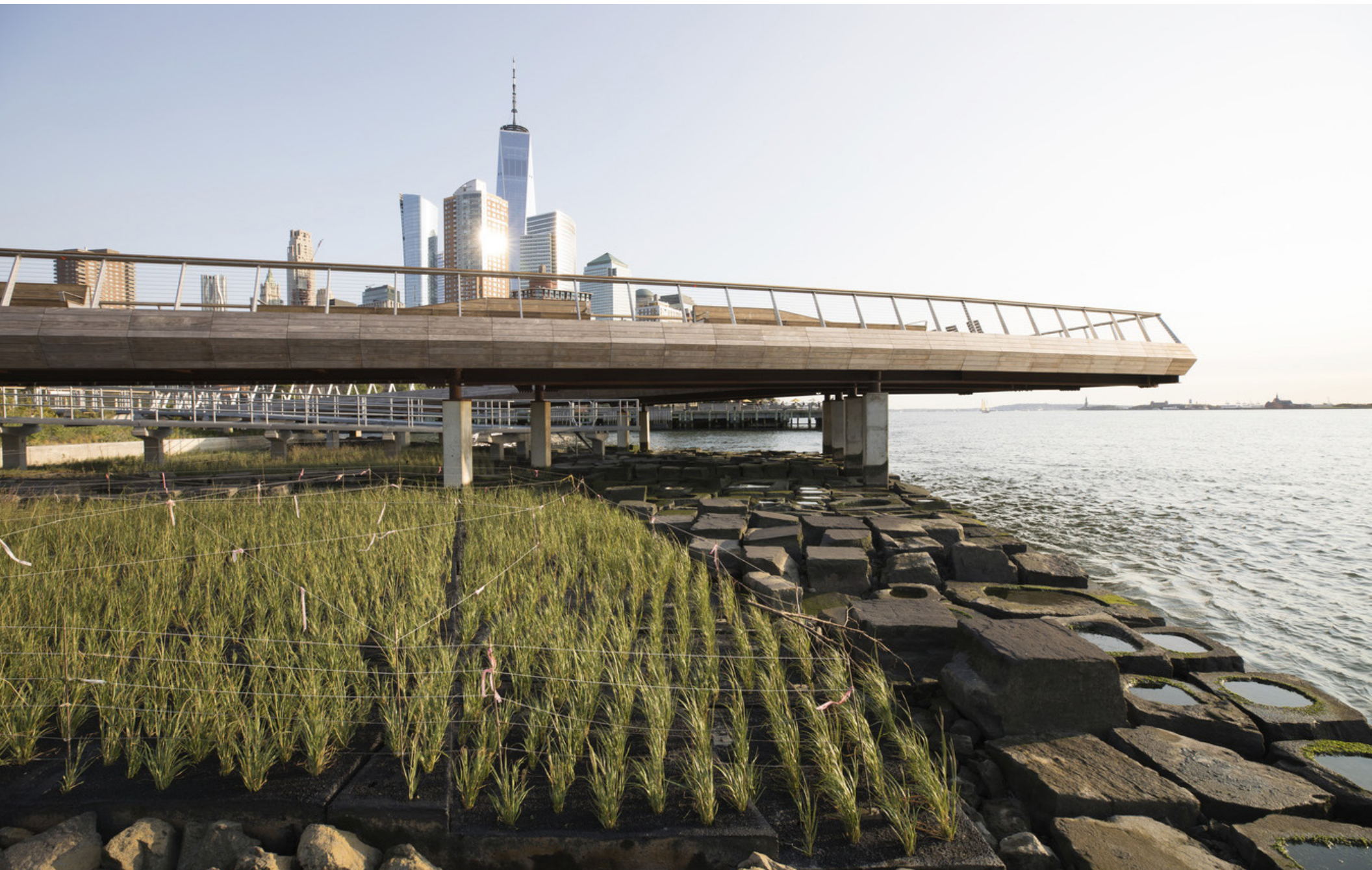
The rocky tidal ecozone at the end of the pier has quickly become a haven for a variety of algae, plant, and animal life, with numerous wildlife species sighted within the constructed riverscape just days after it was completed.