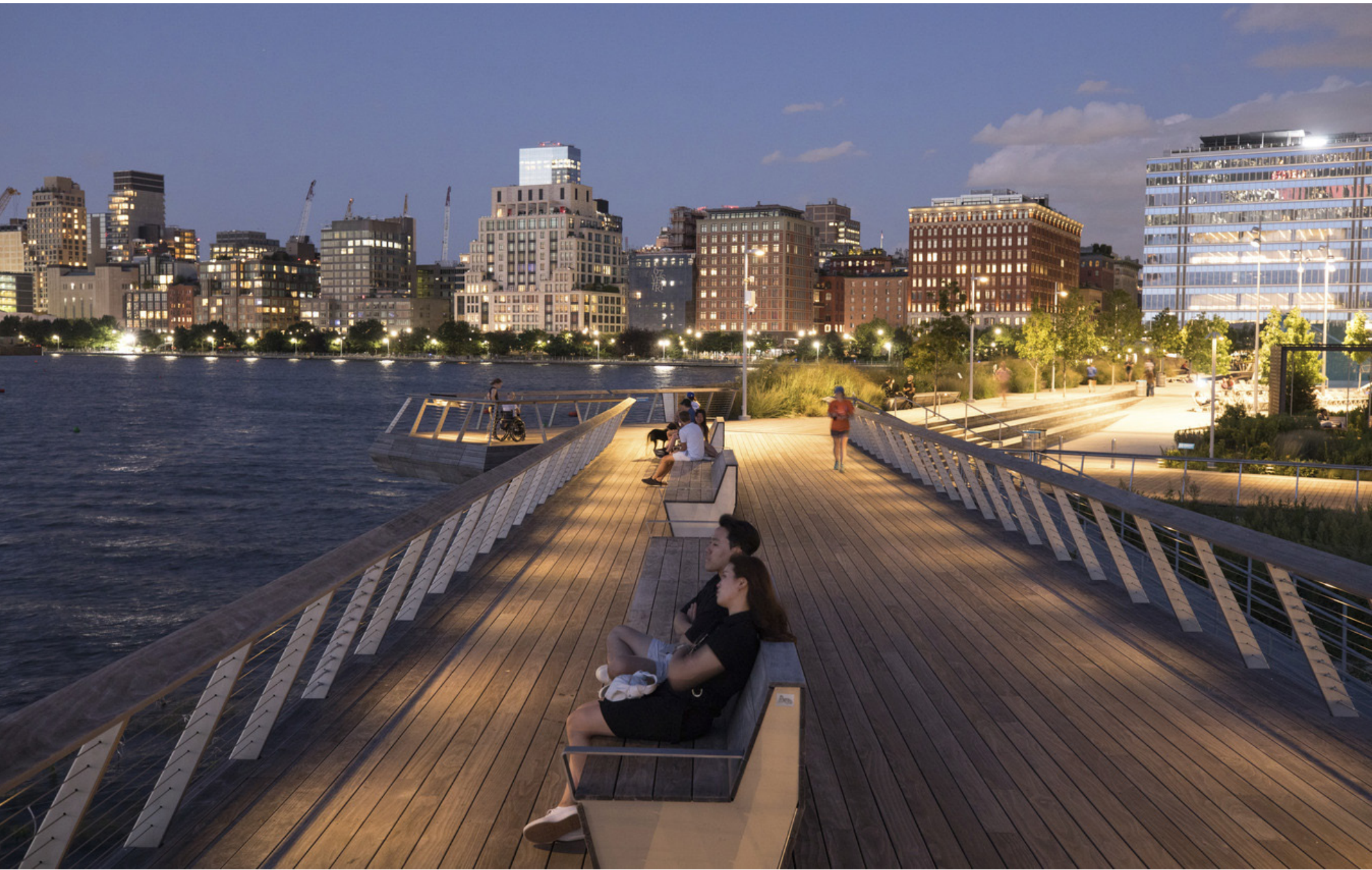
The viewing deck evokes a sense of wonder and exhilaration—ensuring that new memories will endure and shape future stewardship of our precious environment.