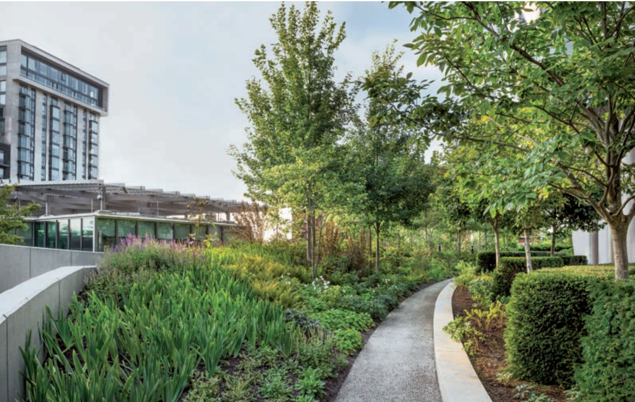
During special events visitors walk from the Consular Garden through a woodland planting and out to a special Event Lawn, which has views over the pond to the Thames River. Curved paths extend the sense of depth in the landscape.