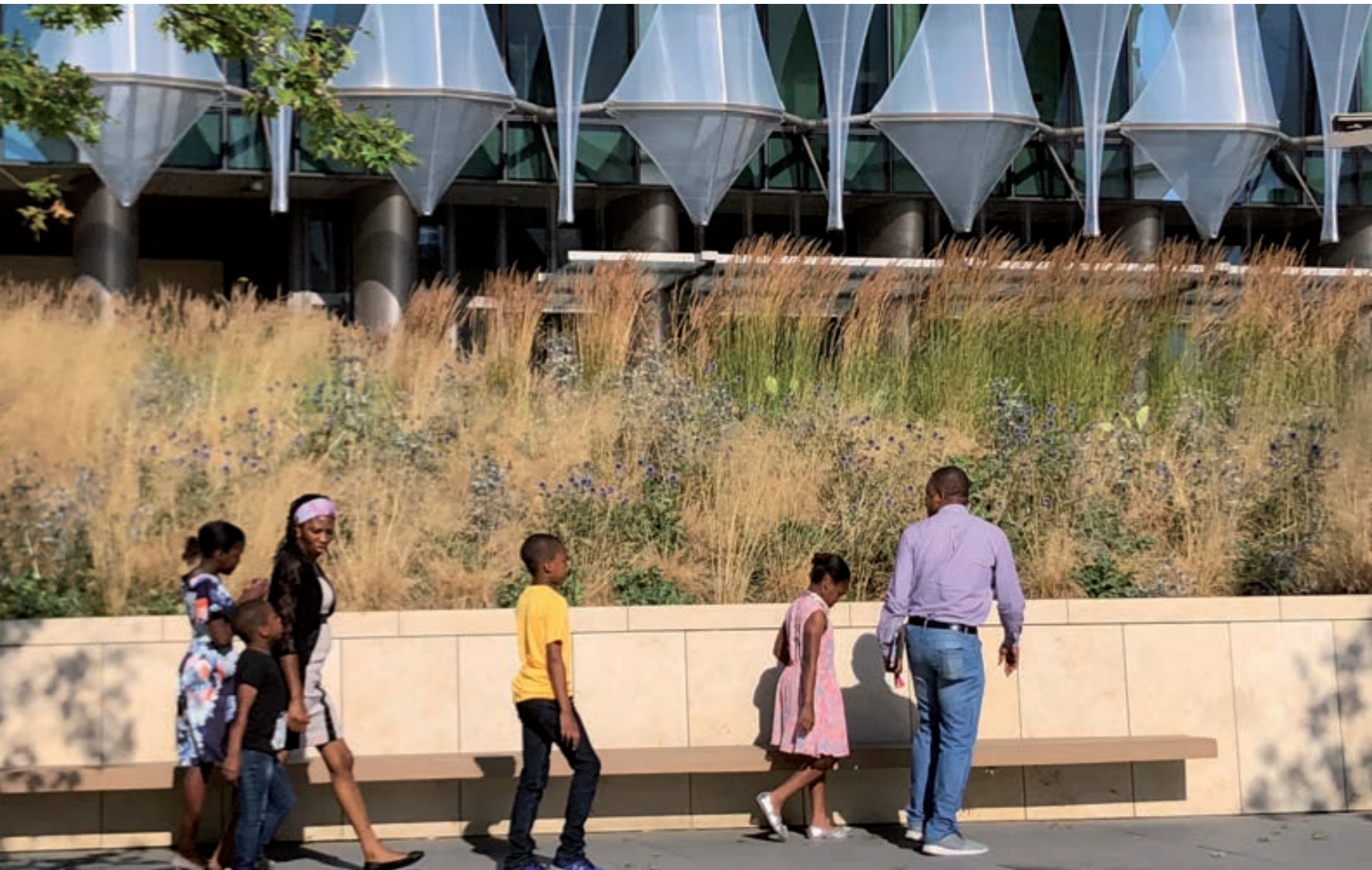
The landscape creates a welcoming experience for the more than one thousand daily Embassy visitors and transforms security elements into valuable site amenities. An anti-ram wall provides seating for the public and other visitors at Embassy Plaza.