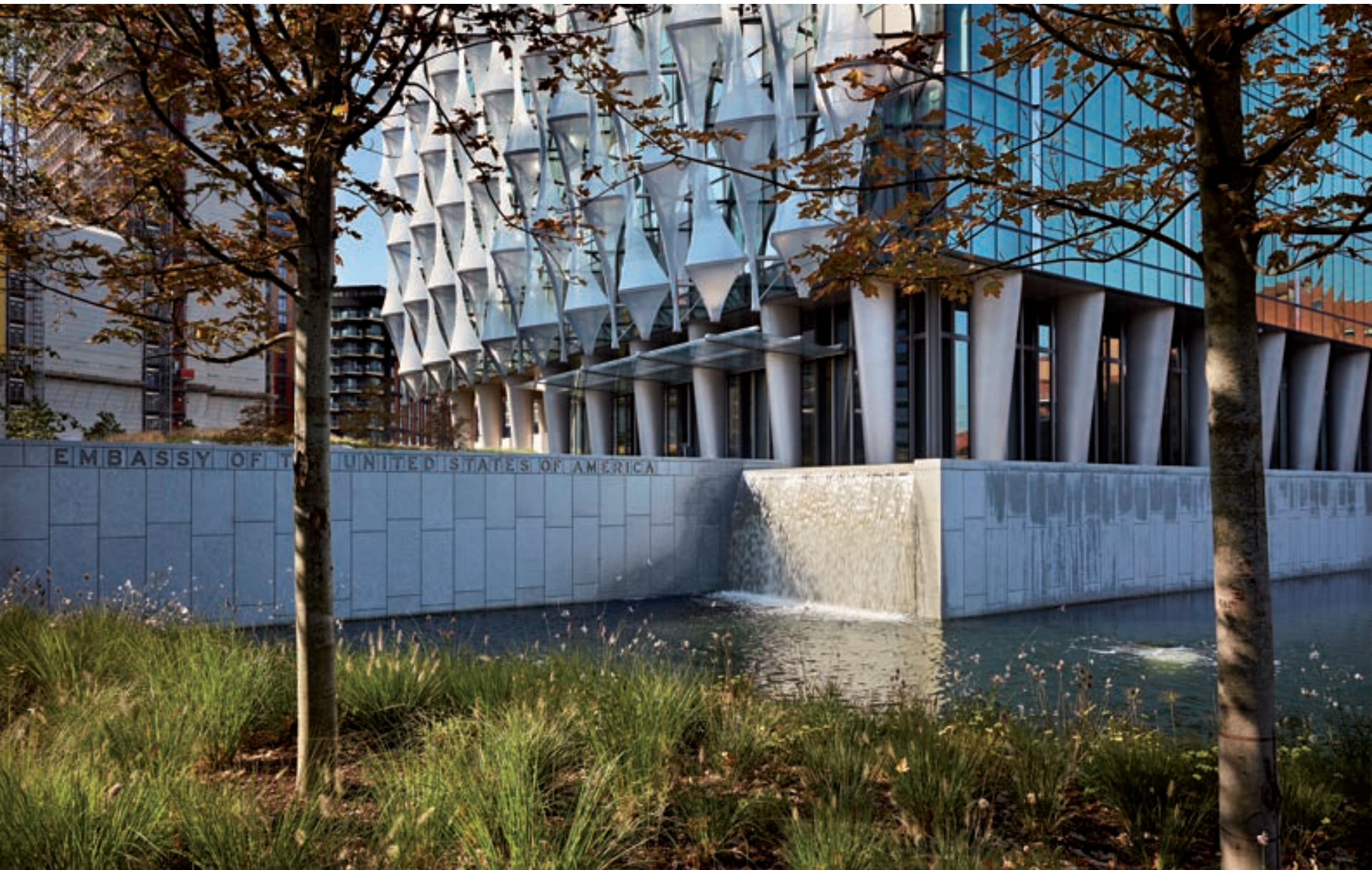
A water rill and two waterfalls greet visitors to the Embassy gardens with calming sounds and provide aeration to encourage water quality and overall pond health.