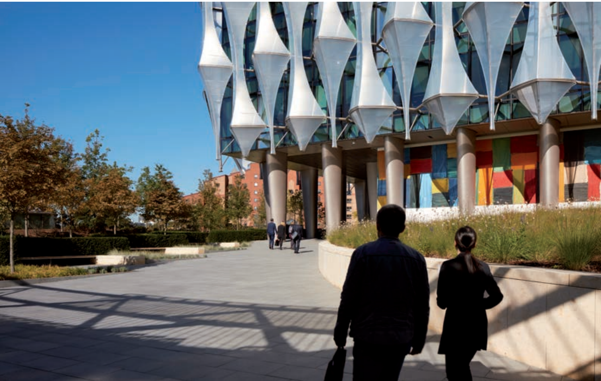
The Consular Garden that surrounds seating areas for those awaiting their appointments is defined by hedges and a perennial border inspired by the English tradition. Works of art are integrated into the landscape experience and welcome visitors.