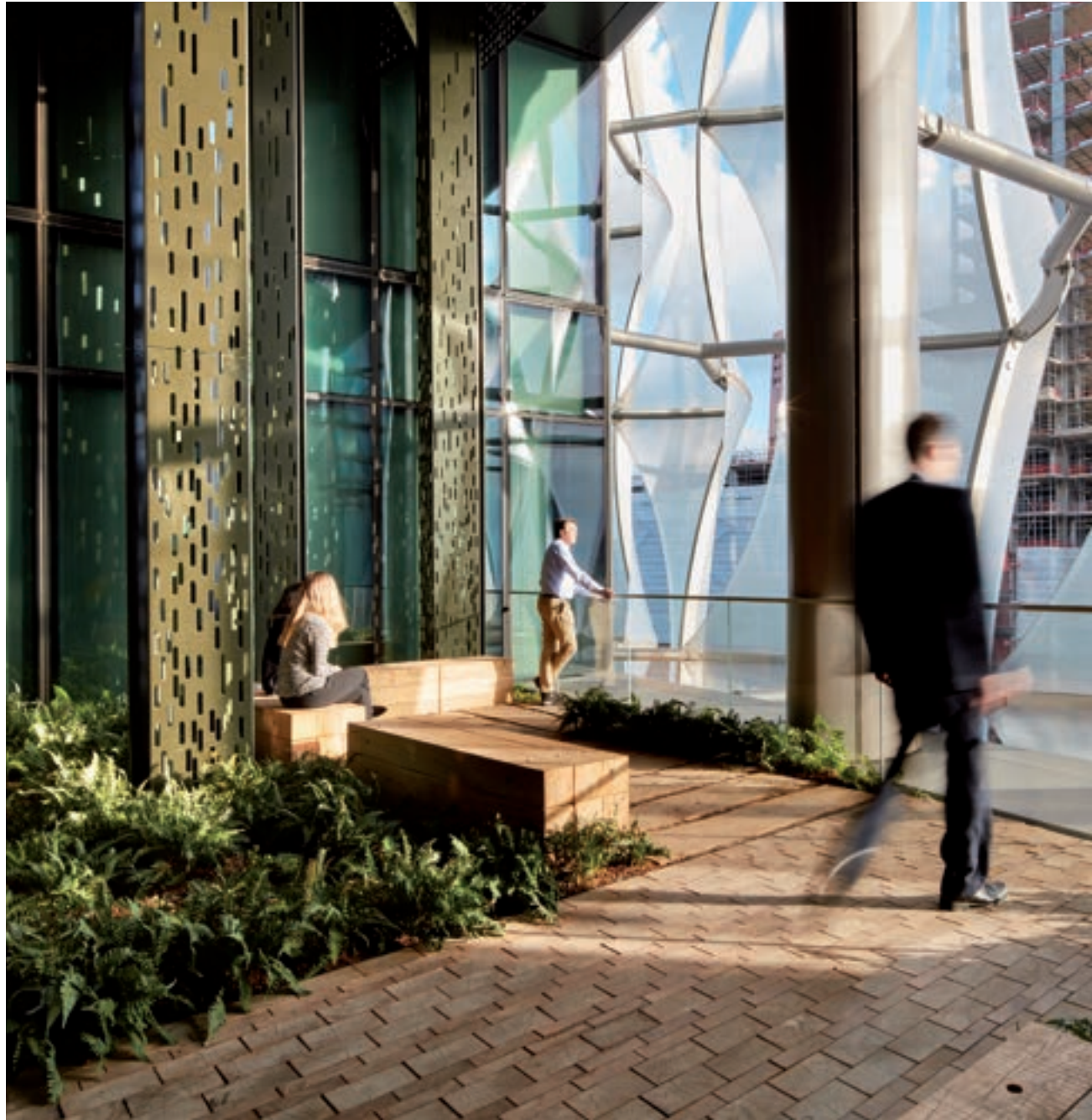
Interior gardens that represent abstractions of quintessential American landscapes, like the Canyonlands of southwest America and the Pacific Northwest woodlands, provide moments of refreshment, valuable interdepartmental social spaces, and alternative circulation within the building.