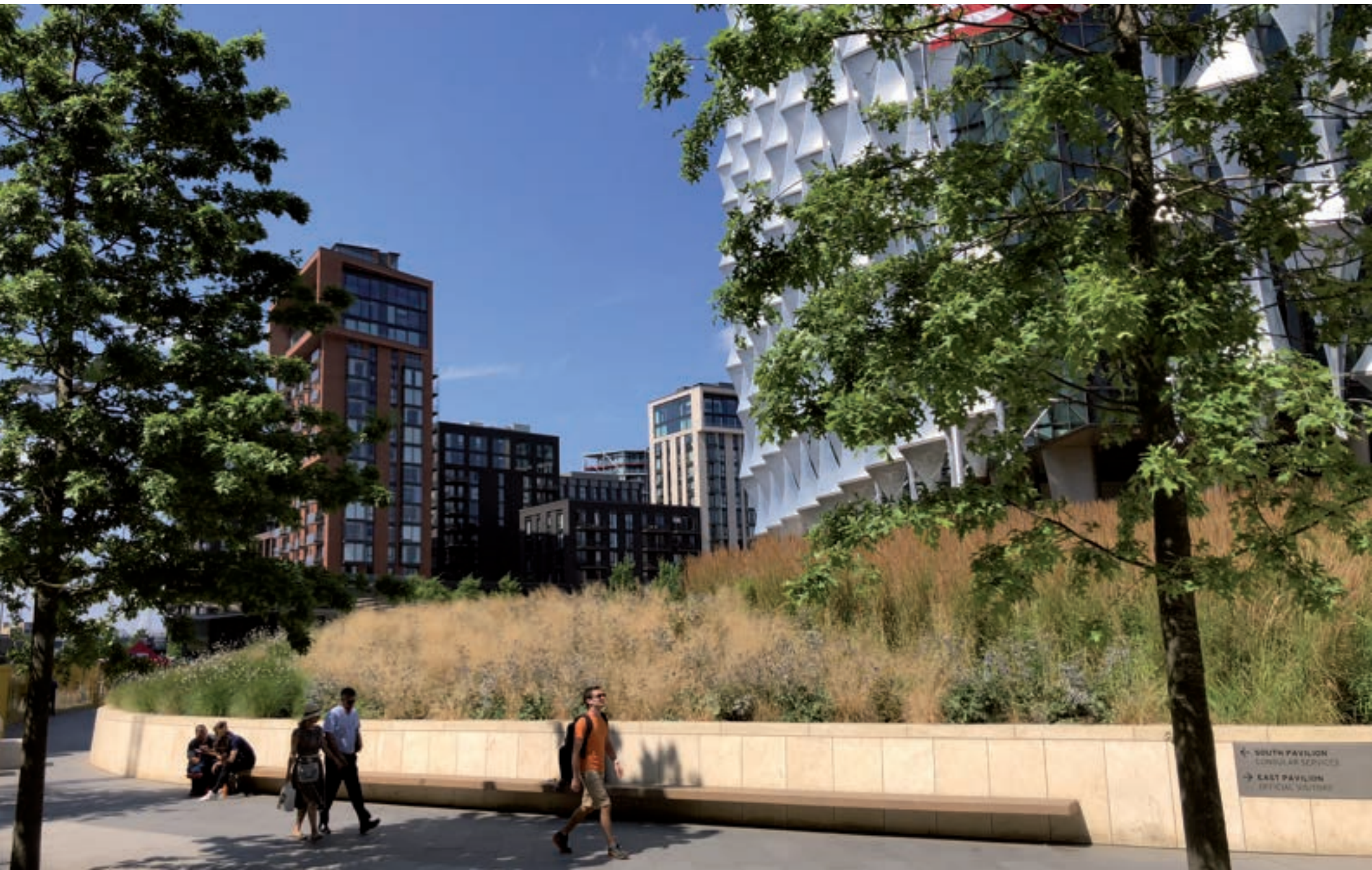
Native meadow grasses that evoke the American prairie and grasslands create habitat, encourage stormwater infiltration, and provide seasonal interest.