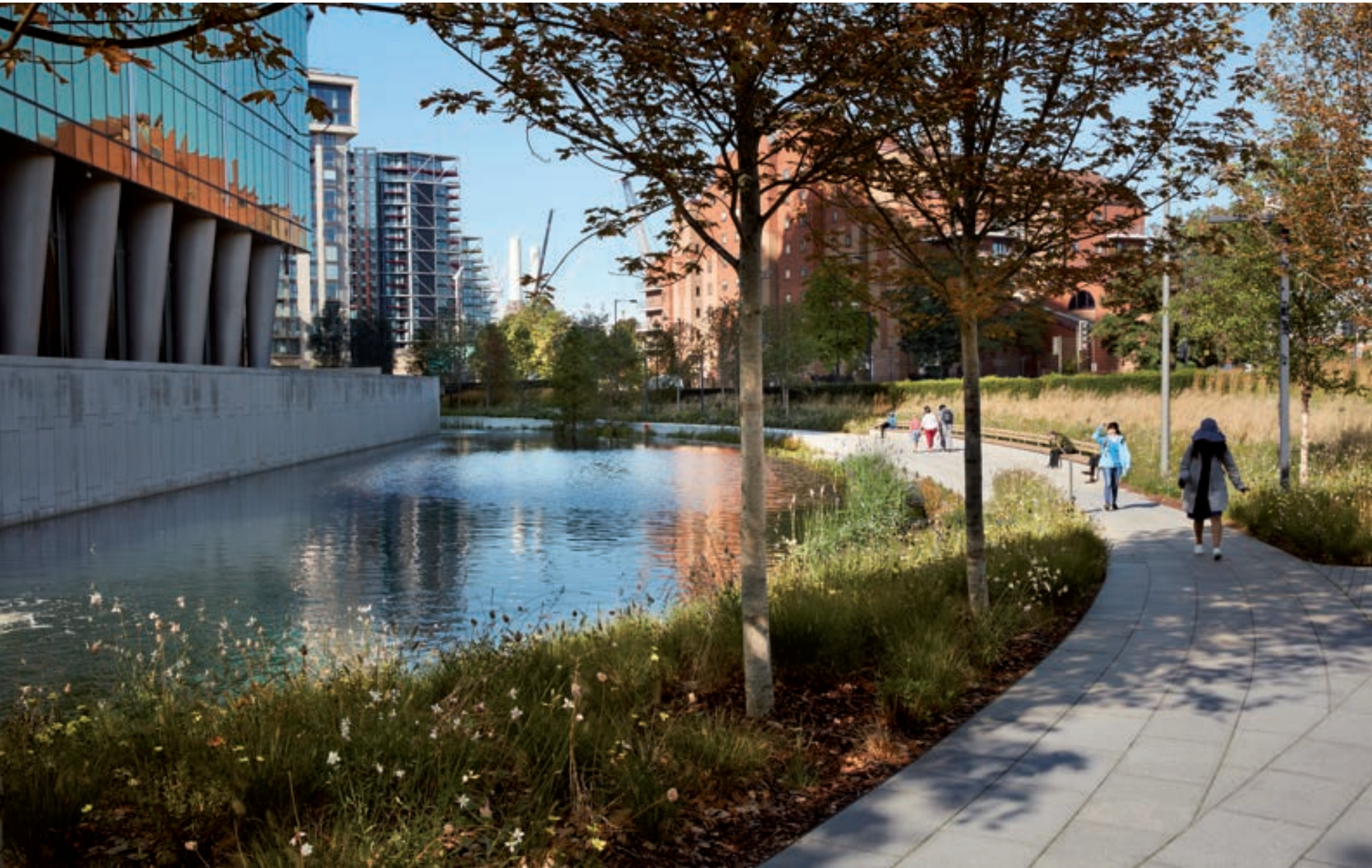
The pond is a key component of the stormwater management system. The meadow plantings work to infiltrate water in situ and wetland plantings cleanse the water. The pond stores all the water captured on site for reuse as irrigation water.