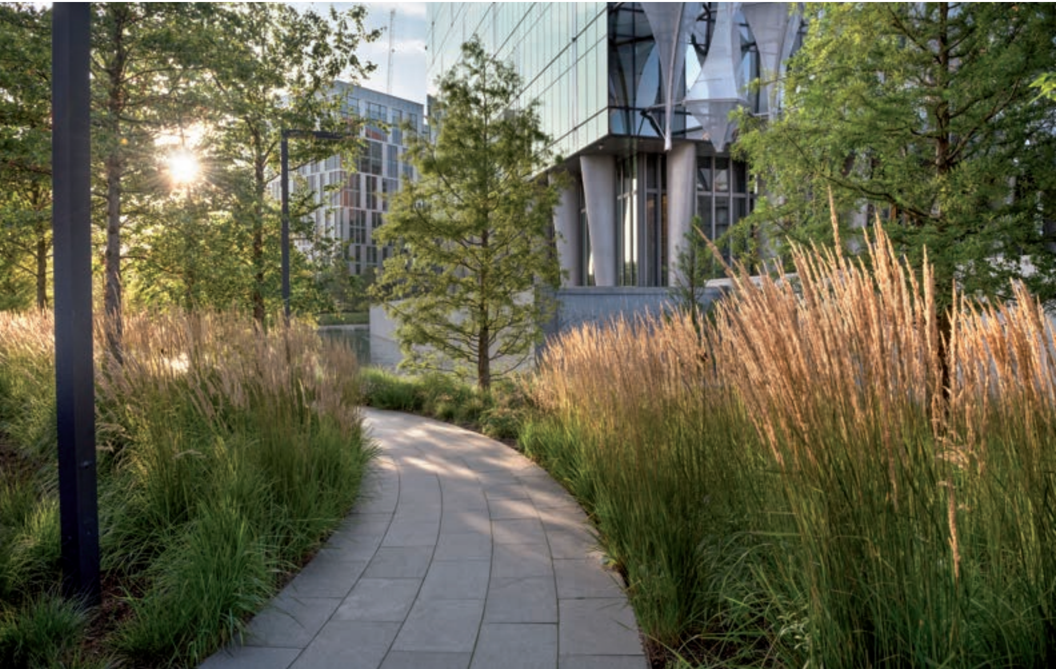
The Embassy Garden provides moments where visitors are surrounded by native plantings and feel immersed in nature in the midst of the dense urban fabric of Nine Elms in the borough of Wandsworth.