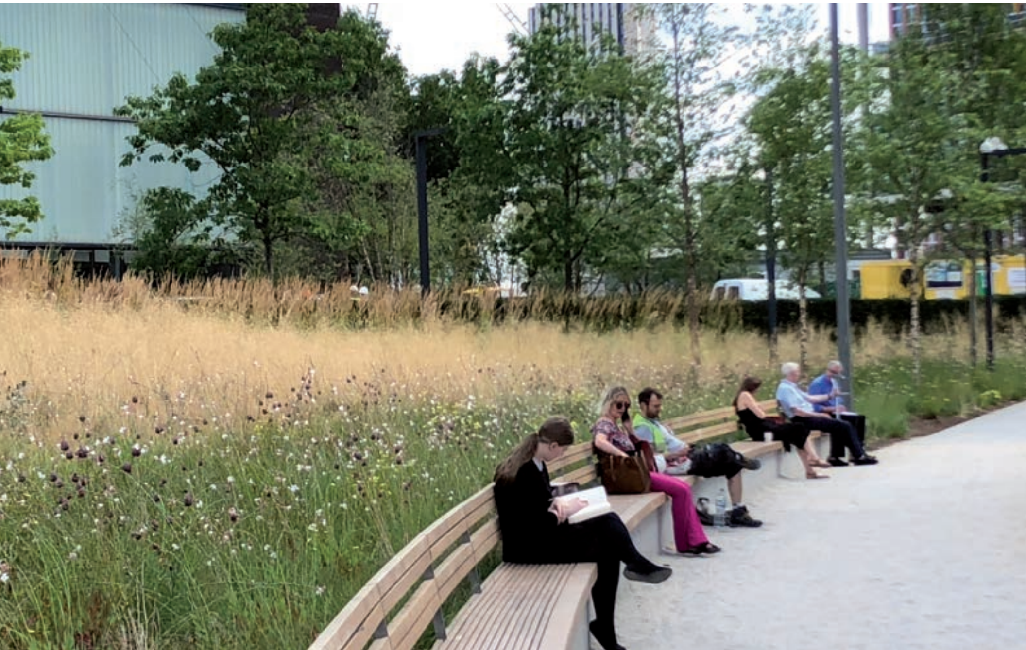
Three different matrices of grasses and perennials create swaths of color and texture that further reinforce the “spiral” form that connects the building to its site and encourages pedestrian flow towards the Embassy entrances.