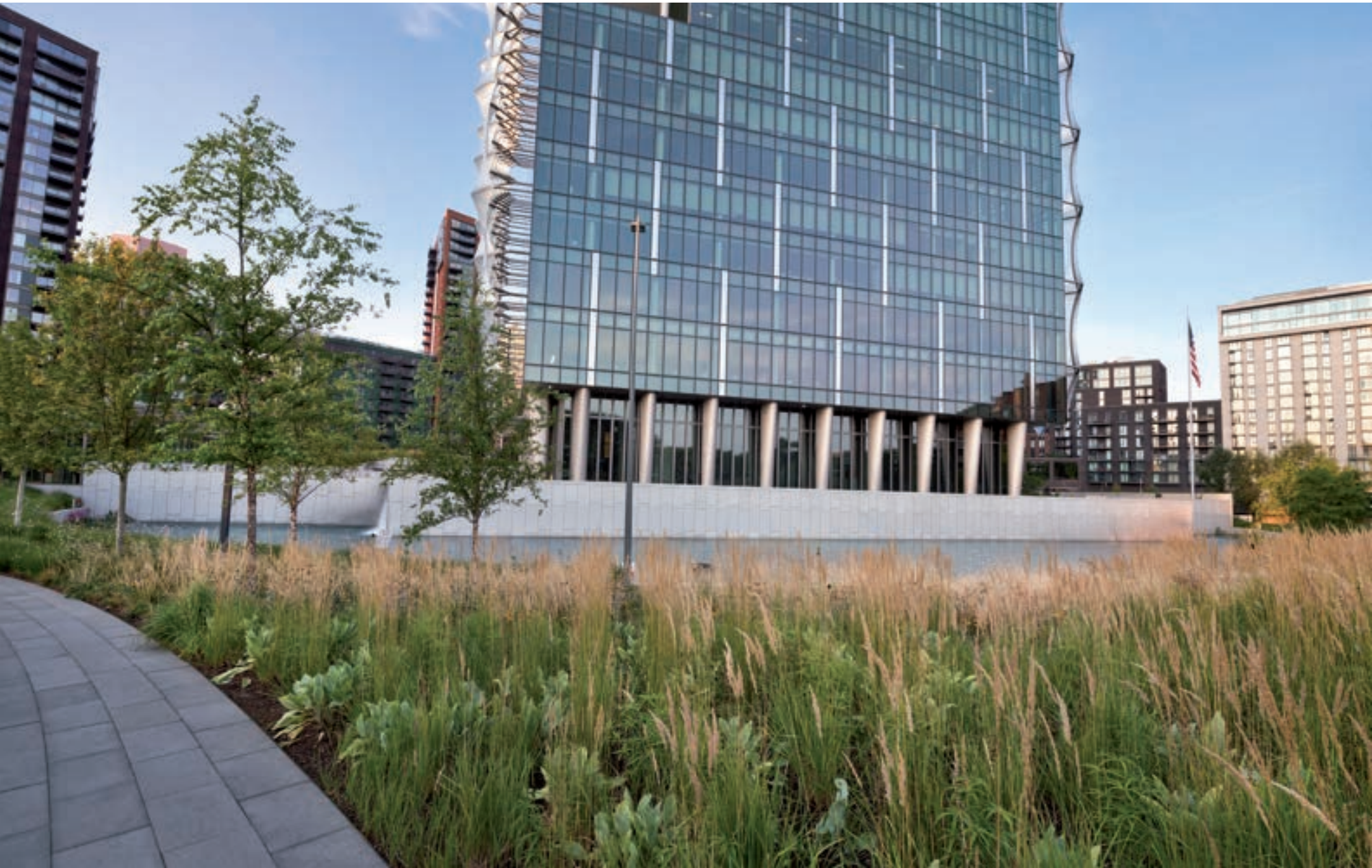
The site features paving and wall materials with low SRIs that do not increase urban heat levels. Tree plantings improve air quality and provide shade while meadow plantings provide seasonal interest.