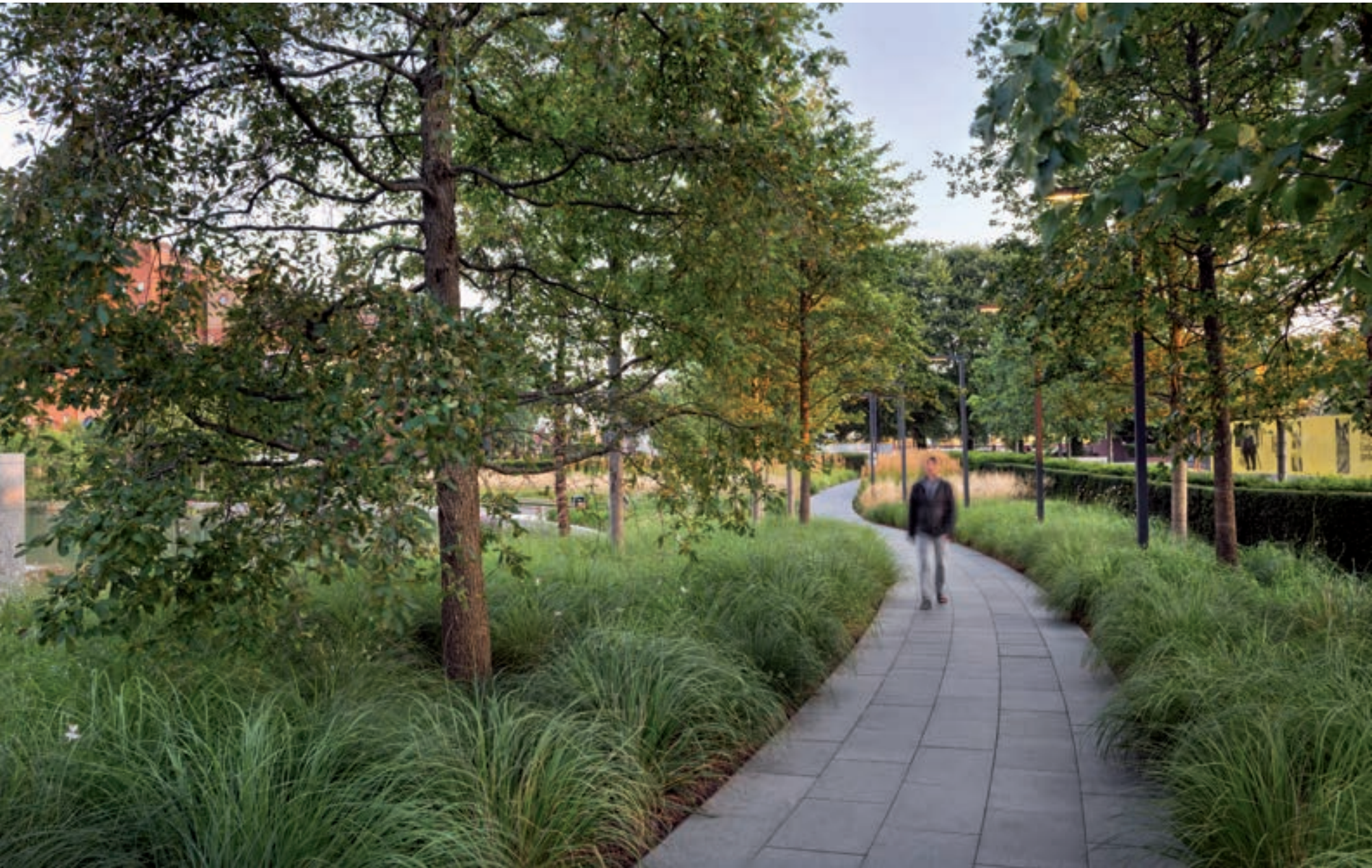
As the first Embassy landscape design to include publicly accessible areas, pedestrians from the north are greeted by an engaging garden of native and adapted plantings. Evergreen hedges, typical of English parks and gardens, add structure and contain security bollards.